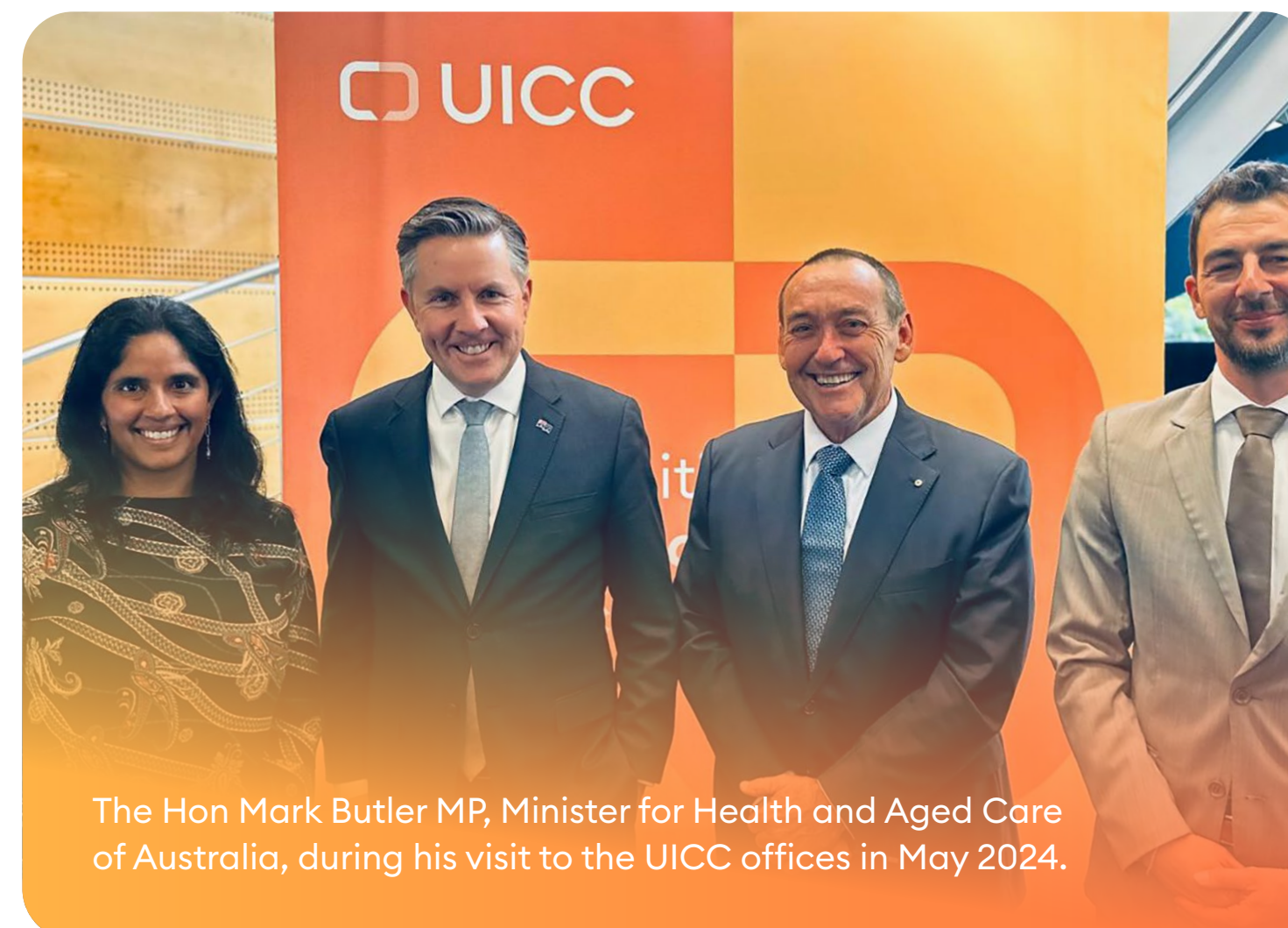
The Hon Mark Butler MP, Minister for Health and Aged Care of Australia, during his visit to the UICC offices in May 2024.

Since 2024, the collaboration has been a UICC-led programme. UICC coordinated multiple meetings with WHO, IARC, NCDA, member states, the International Union Against Tuberculosis and Lung Disease, the International Association for the Study of Lung Cancer, MSD, Boehringer Ingelheim, and AstraZeneca to advance guidance on the lung cancer care pathway, including screening and early diagnosis. At the end of the year, UICC signed an agreement with IARC to support the development of a new handbook on lung cancer screening, which will be available in 2027.